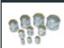
Insulated throat with compression connectors-02