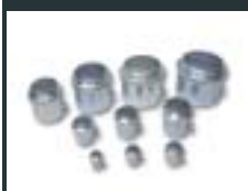
Uninsulated connectors steel-01