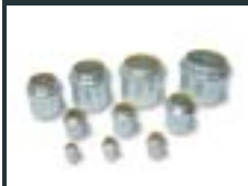
Insulated throat connectors steel-02

Down Load: Connectors DOC , Connectors PDF , Connectors Manufacturer , Supplier , Factory , Exporter in china